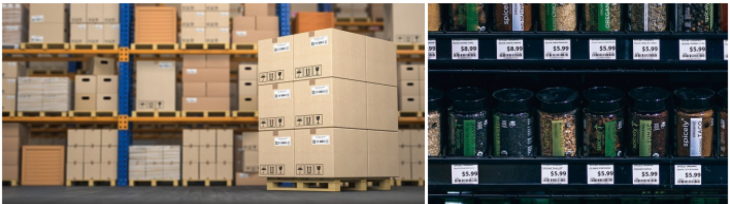
Warehouse Management, Express & Logistics, Industrial Labels, Packaging Labels, Retail Labels, Order Sorting